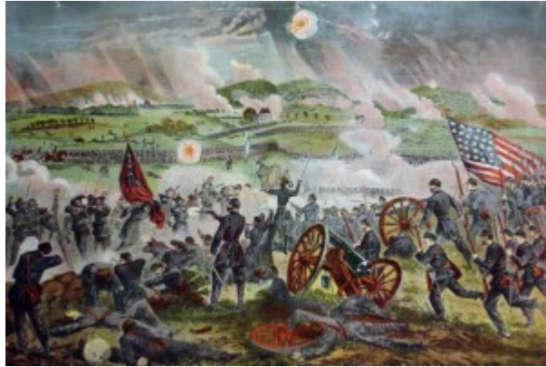
A colorized version of the Confederate attack on Union lines on July 3

The battle climaxed on July 3, in one of the bloodiest attacks in U.S. history. Confederate Generals Longstreet and Hill sent more than 12,000 Confederates to participate in the doomed "Pickett's Charge." More than half of these men never returned from this failed attempt at breaking the center of Meade's line. 59 Afterwards, General Lee remarked to an observer from the British Coldstream Guards: "This has been a sad day for us, Colonel, a sad day." 60 In the years that followed the battle, Gettysburg went down in legend as the "High Tide" of the Confederacy.