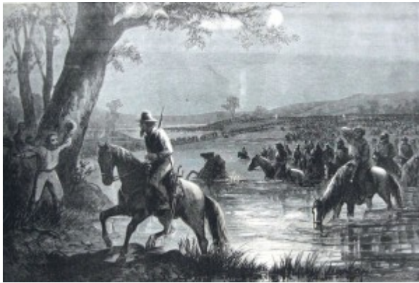
Southern soldiers crossing the Potomac River into Maryland on September 4, 1862

Jackson's victories in the Shenandoah Valley Campaign in the spring of 1862, along with General Robert E. Lee's success on the York-James Peninsula around Richmond, showed that Union victory was far from assured. General Lee decided to move his army out of