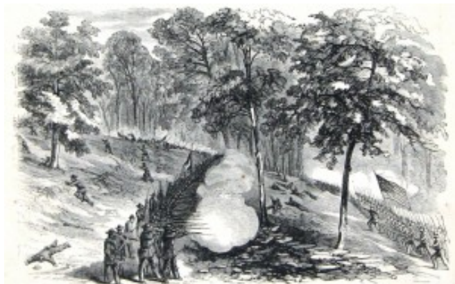
Fighting at Crampton's Gap during the Battle of South Mountain, September 14, 1862 (Harper's Weekly, October 25, 1862; A.R. Waud, artist; NPS History Collection)

At the Battle of South Mountain, the Union Army of the Potomac fought for possession of three mountain gaps. The outnumbered Confederate troops who held the passes protected Lee's widely dispersed army. By late afternoon, the Union Sixth Corps took possession of Crampton's Gap near Burkittsville, the southern-most pass, but Maj. Gen. William B. Franklin failed to aggressively follow-up his victory, which denied the Union army its only opportunity of relieving its encircled garrison at Harpers Ferry. The Union army gained possession of Fox's Gap a little later in the evening and Turner's Gap later in the day. That evening Lee withdrew