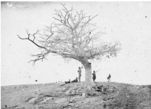
A solitary grave, a barren tree and several Union soldiers share a hilltop on the battlefield

Following the Battle of Antietam, a number of hospitals were established in the region to treat sick and wounded soldiers. In Washington County the Union army established at least 115 temporary field hospitals in homes, barns, public buildings, and in fields. 45 Two weeks after the battle, President Lincoln came to the region to tour the battlefield, visit the camps, and encourage General McClellan to pursue the Confederates. On October 3 Lincoln walked through a hospital that housed a number of Confederate wounded. A correspondent with the party wrote: "The President . . . remarked to the wounded Confederates that if they had no objections he would be glad to take them by the hand. . . . that many were our enemies through uncontrollable circumstances, and he bore them no malice, and could take them by the hand with sympathy and good feeling." In the weeks that followed the battle the wounded were sent to permanent hospital facilities in Frederick, Baltimore, and other locations. 46