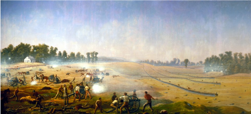
A scene from the Battle of Antietam, painted by James Hope, who had been a participant in the fighting (Antietam National Battlefield)

The heated words and actions of early 1861 turned into bullets and cannon balls on April 12 when Confederate forces fired on Fort Sumter. Mid-Maryland and the Virginia countryside bordering the Potomac River were quickly transformed into a war zone as both sides recognized the strategic military significance of the invisible dividing line.