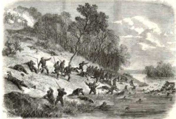
Retreat of Union forces at the Battle of Ball's Bluff

During the summer of 1861, the Confederates constructed a series of forts around Manassas Junction and in Fairfax and Loudoun Counties. Among them was Fort Evans, near Leesburg. The presence of Confederate forces so close to Washington worried Lincoln. That fall Major General George B. McClellan, the new commander of the Army of the Potomac, directed a series of movements to maneuver the Confederates out of northern Virginia. 20