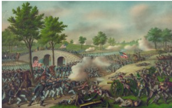
"Battle of Antietam," lithograph by Kurz and Allison, 1888, showing the fighting around Burnside Bridge